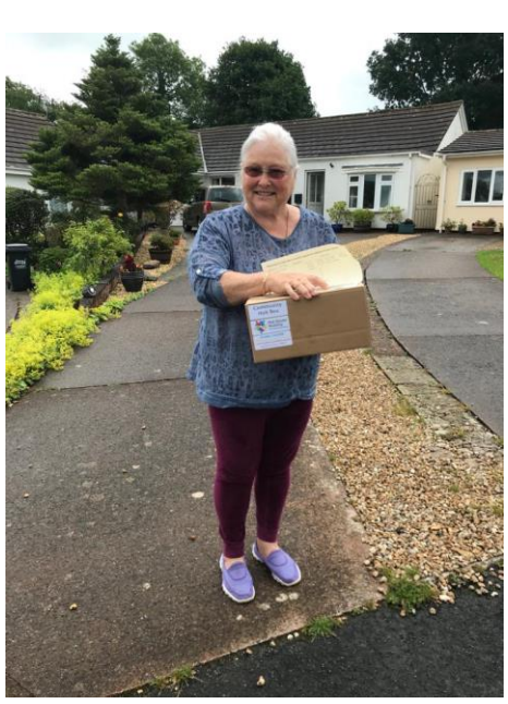
Our Mission Statement "Increasing the independence, mobility and peace of mind of older, disabled and isolated people in our communities"